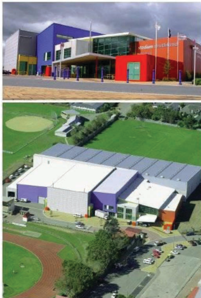
Figure 1. Stadium Southland prior to collapse

In November 1999, during construction of the stadium, excessive deflections were observed in the roof trusses that had been erected above the community courts area. Remedial works were necessary to address the deflections. A revised building consent was obtained for the revisions involved in the remedial works. The building opened in 2000.