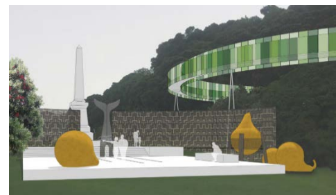
Figure 2: Puhi Kai Iti

'Puhi Kai Iti' will be sited adjacent to the Cook Monument and will seek to depict Māori navigational history and stories of Maui, Paikea, and local Iwi, Ngāti Oneone. A fish tail sculpture (Ikaroa), 'gourd' art pieces reference to Maia, and a connector for all Tūranganui-a-Kiwa (Gisborne) iwi, plus double skinned perforated metal 'Story Panels' decorated with a tukutuku weaving pattern will create the architectural framework for this significant new Taonga.