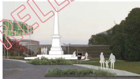
Figure 1: Cook Monument proposed

A new concrete plinth, landscaping and access path is also proposed to be installed around the base of the Cook Monument to provide a platform for story-telling and a meeting place for visitor tours.