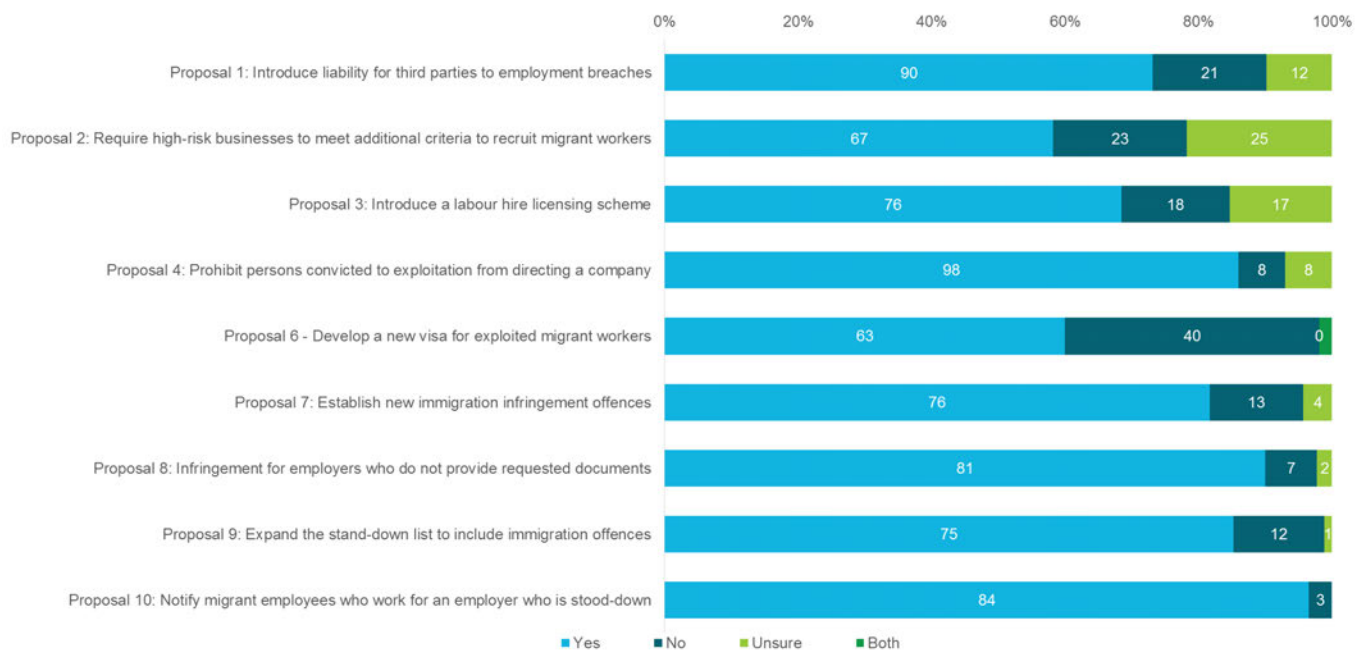
Figure 1: Headline summary of submissions by proposal