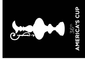
36 th AMERICA'S CUP