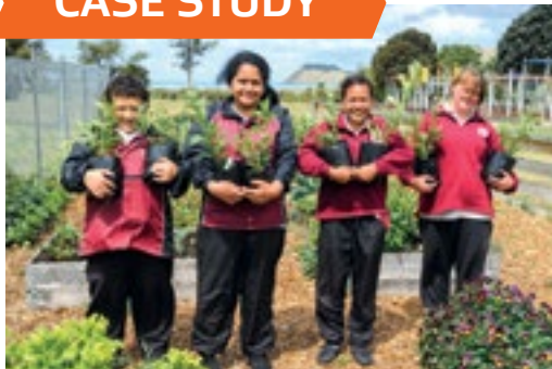
– The Uawa/Tolaga Bay community are working with the Allan Wilson Centre on the Uawanui Project