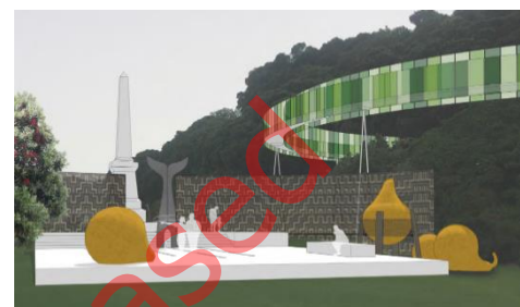
Figure 2: Puhi Kai Iti

‘Puhi Kai Iti’ will be sited adjacent to the Cook Monument and will resonate with Māori navigational history and stories of Maui, Paikea, and Ngāti Oneone. A fish tail sculpture (Ikaroa), ‘gourd’ art pieces (a reference to Maia, and a connector for all Tūranganui-a-Kiwa iwi), plus double skinned perforated metal ‘Story Panels’ decorated with a tukutuku