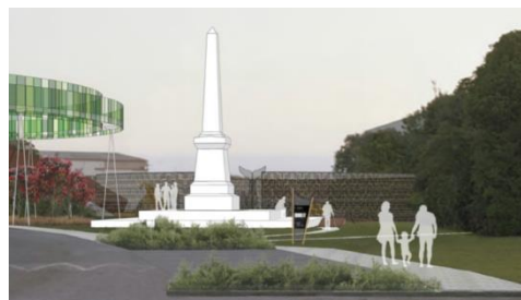
Figure 1: Cook Monument proposed

The Cook Landing Site Obelisk is a category 1 registered monument. Plans are to clean, restore and earthquake strengthen the obelisk.