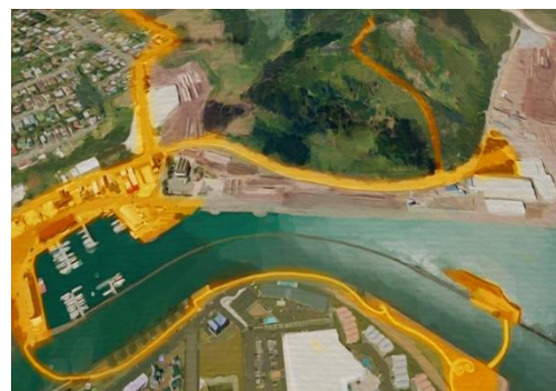
Figure 5: Tairāwhiti Navigations Trail

These proposed works will be leveraging off the multi-million dollar investments already well underway including the Titirangi Maunga restoration project, Inner Harbour redevelopment, 'Tairāwhiti' waka hourua, the Hawaiki Turanga Gateway Sculpture and the Tu Pāpa historical interpretations trail/hikoi; (see brochure attached for more information on Tairāwhiti Navigations