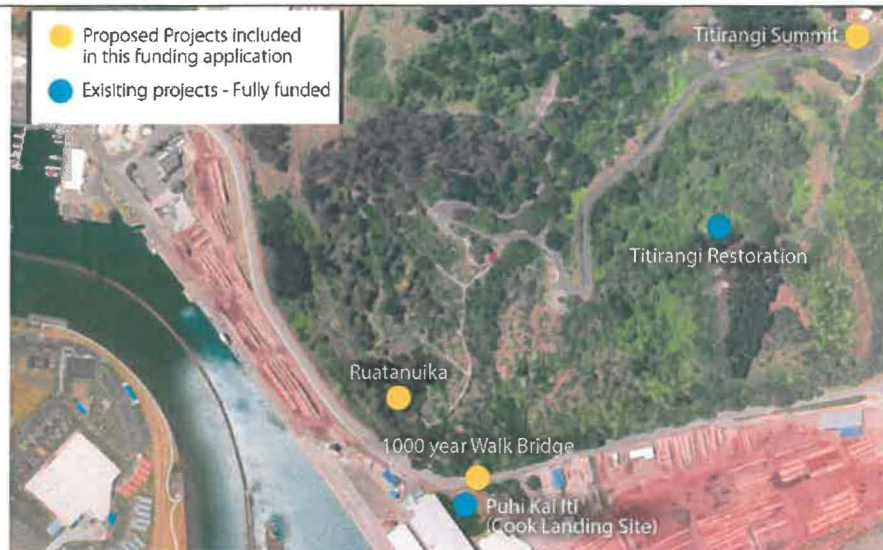
Figure 1: Titirangi-Puhi Kai Iti connections

The aim of this proposal is to secure funding in time for us to complete these upgrades by October 2019 in time for Tuia – First Encounters 250 the Tier 1 national commemoration of the first landing of James Cook and meeting of Māori and Europeans cultures in October 1769.