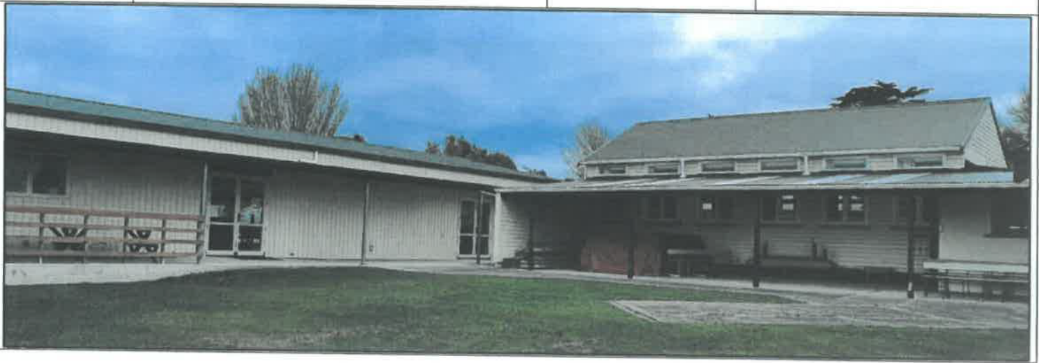
Manaakitangata, the wharekai (left) and Tūwhatu, the whare kaumātua (right).