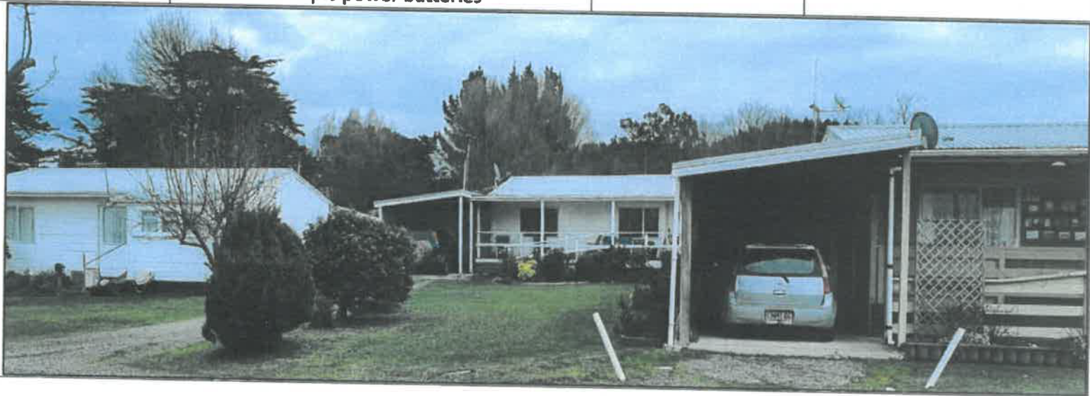
The three whare kaumātua at Taumata o te rā marae.