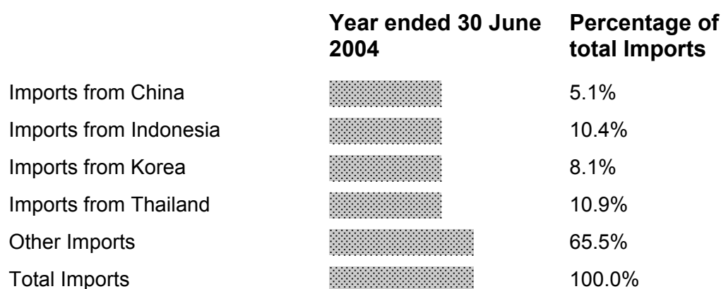
Table 4.1: Volume of Imports (Per Unit)

71. Table 4.1 shows the allegedly dumped imports from China, Indonesia, Korea and Thailand, as a percentage of total imports of like goods into New Zealand, are greater than 3 percent in all cases. Therefore, the volumes of imports are not negligible according to Article 5.8 of the Anti-dumping Agreement.