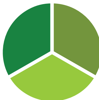
Use of the Fund each year

HRC: Administered by HRC MBIE: Available for reinvestments MBIE: Existing contracts