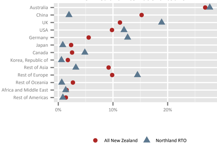
International tourist spend in Northland RTO compared to all New Zealand international tourism