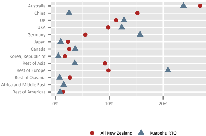
International tourist spend in Ruapehu RTO compared to all New Zealand international tourism