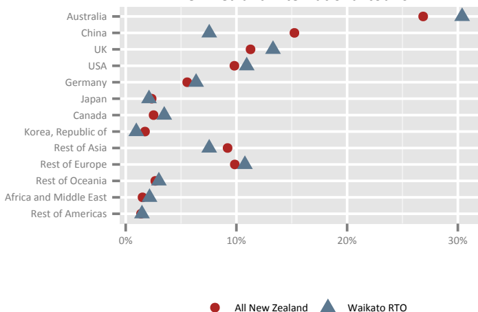
International tourist spend in Waikato RTO compared to all New Zealand international tourism