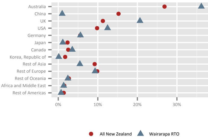
International tourist spend in Wairarapa RTO compared to all New Zealand international tourism