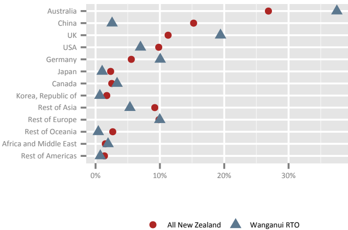
International tourist spend in Wanganui RTO compared to all New Zealand international tourism