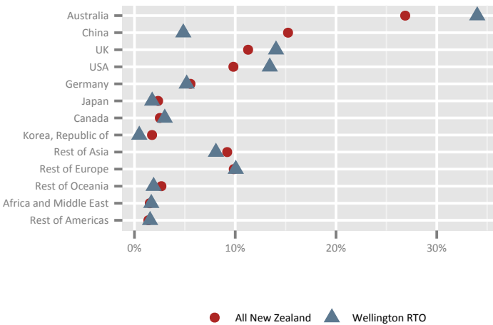
International tourist spend in Wellington RTO compared to all New Zealand international tourism