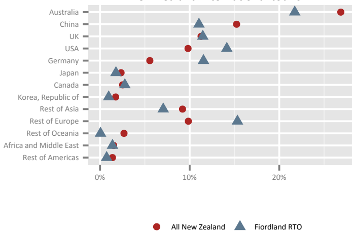
International tourist spend in Fiordland RTO compared to all New Zealand international tourism