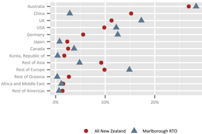
International tourist spend in Marlborough RTO compared to all New Zealand international tourism