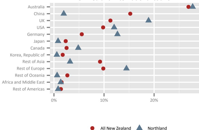
International tourist spend in Northland compared to all New Zealand international tourism