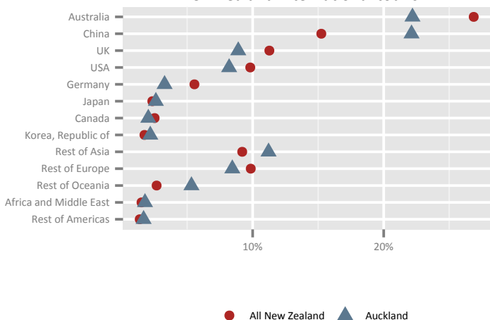
International tourist spend in Auckland compared to all New Zealand international tourism