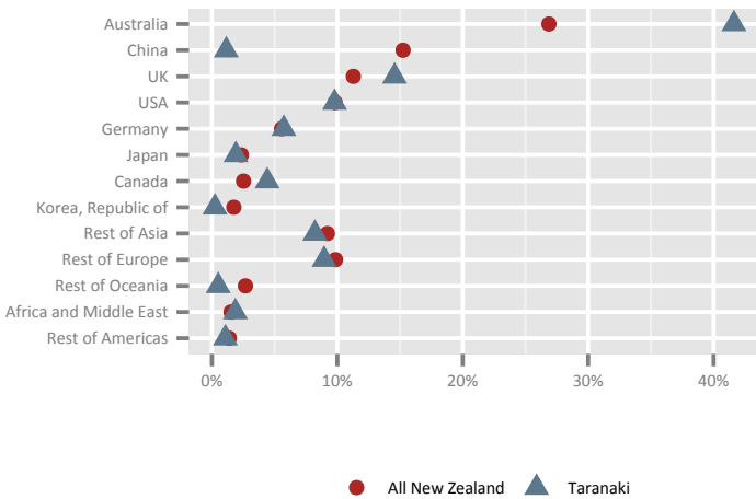
International tourist spend in Taranaki compared to all New Zealand international tourism