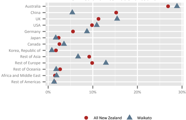
International tourist spend in Waikato compared to all New Zealand international tourism