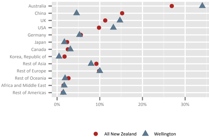
International tourist spend in Wellington compared to all New Zealand international tourism