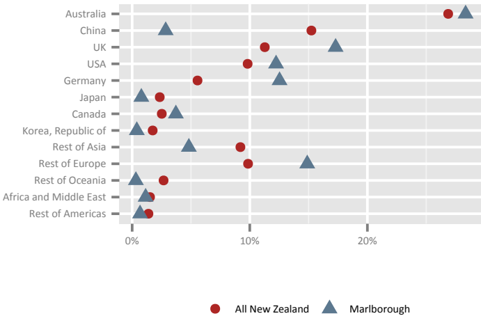
International tourist spend in Marlborough compared to all New Zealand international tourism