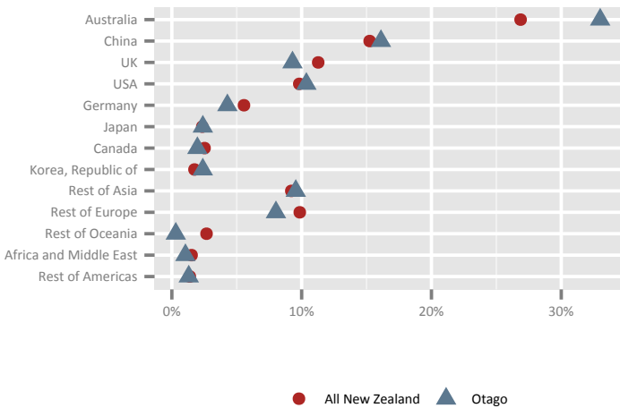
International tourist spend in Otago compared to all New Zealand international tourism