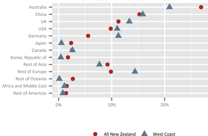
International tourist spend in West Coast compared to all New Zealand international tourism