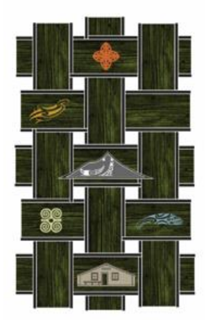
E KORE E MIMITI TE PUNA KOROPUPÔ

Energy Resources Markets Branch Ministry of Business, Innovation and Employment 15 Stout Street PO Box 1473 Wellington 6140