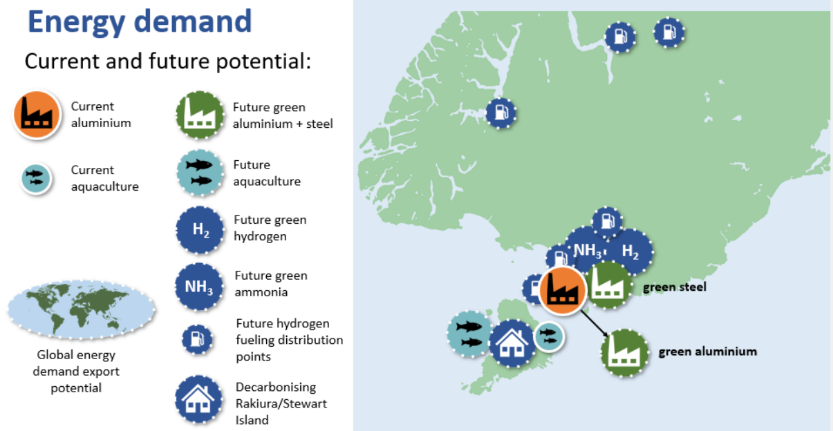
Figure 2: Current and Future Demand Projects; Source: Murihiku Regeneration Energy Transition Plan, 2023