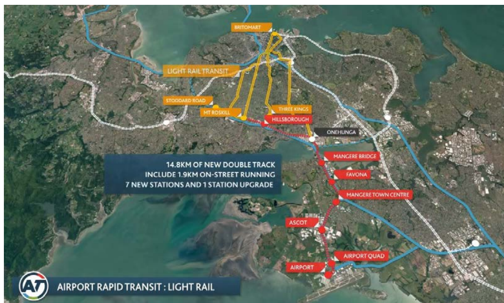
Figure 36: Suggested Auckland light rail expansion

Auckland Transport is investigating adding light rail or heavy rail lines to replace some of the most heavily used bus lines in the region. The study is considering replacing the bus routes on Dominion Road, Manukau Road, Mt Eden Road, Symonds Street and Queen St with light rail routes, and providing a link to the existing airport rail network. The cost of this expansion is estimated to be approximately $1 billion. The network could improve access for tourists to Auckland who don't use the road network, and reduce congestion for those who do. It will also be important for business events. The estimated time to travel from Aotea to the airport would be 41 minutes, while travelling from Britomart to the airport would take between 39 and 44 minutes.