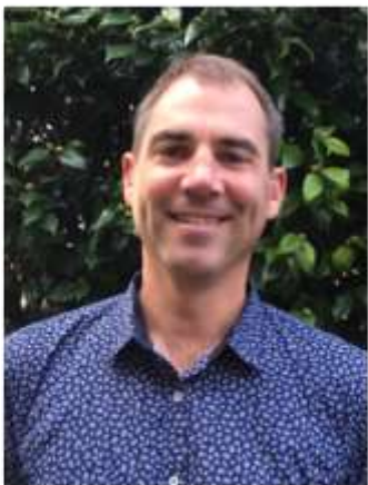
Glen Bennett Community