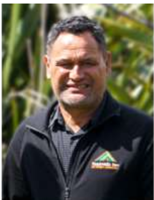
Wharehoka Wano Iwi