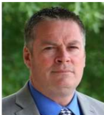
Waid Crockett Local Government