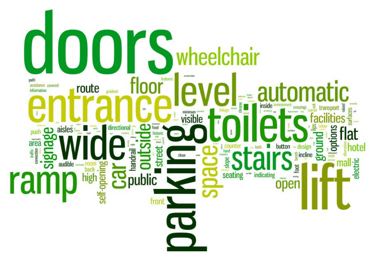
Figure 1: Characteristics of accessible buildings

Figure 2 depicts the characteristics that make buildings difficult to access. The larger the text the more often the word was mentioned. While the same words may feature in both diagrams, in the characteristics of a building with poor access the word lifts refers to the lack of a lift. The words most commonly used discussing buildings with difficult access (from most common) were: stairs, door, lifts, entrance, up, ramp, toilet, park, wheelchair and floor. Explanations of the aspects of buildings that make them difficult to access are appended (Appendix 3).