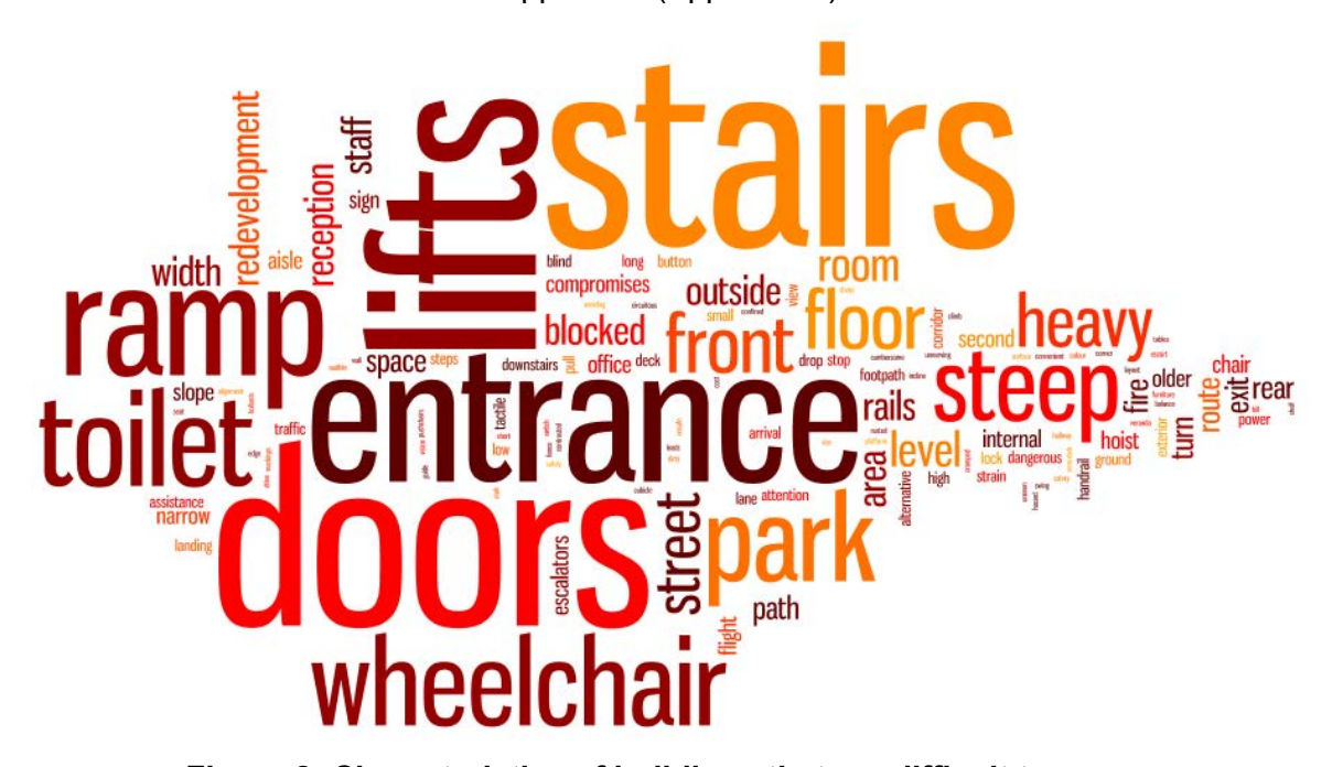
Figure 2: Characteristics of buildings that are difficult to access

Figure 2 depicts the characteristics that make buildings difficult to access. The larger the text the more often the word was mentioned. While the same words may feature in both diagrams, in the characteristics of a building with poor access the word lifts refers to the lack of a lift. The words most commonly used discussing buildings with difficult access (from most common) were: stairs, door, lifts, entrance, up, ramp, toilet, park, wheelchair and floor. Explanations of the aspects of buildings that make them difficult to access are appended (Appendix 3).